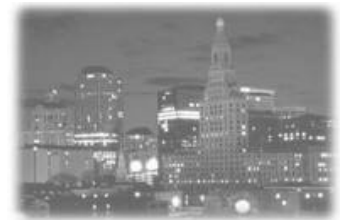
Downtown Hartford at Night

For additional help with directions, please visit our Web Site at http://www.teena-ryan.com .